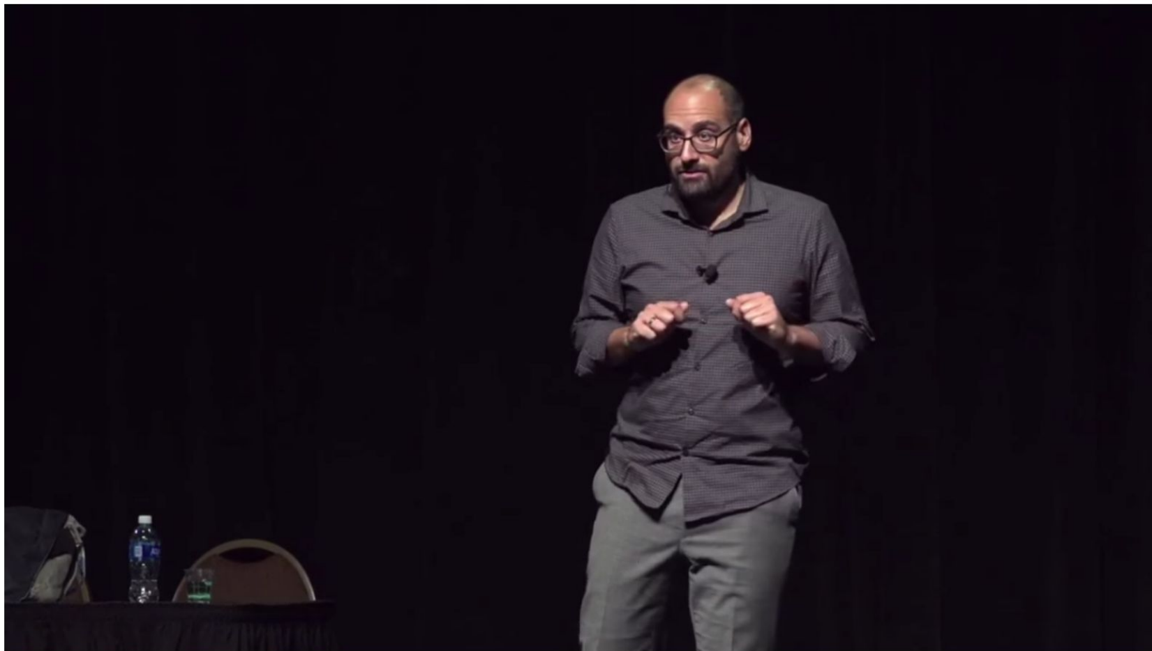
Ali Rahimi - NIPS 2017 Test-of-Time Award presentation